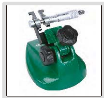
micrometer stand with clamp (optional)

ATTENTION: LOW PARALLELISM OF TWO MEASURING FACES